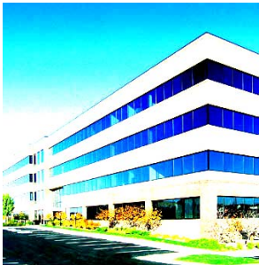
Arriving at NWR Surgery Center

Driver's license, photo ID, insurance card and co-pay (if applicable).